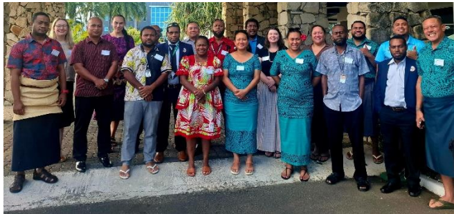
Nineteen investigators from eight offices took part in a regional workshop in the Cook Islands, that we co-hosted in June.