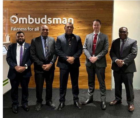
Delegations of Ministers and MPs from Papua New Guinea and Bougainville visited in August to learn more about our role, particularly during elections.