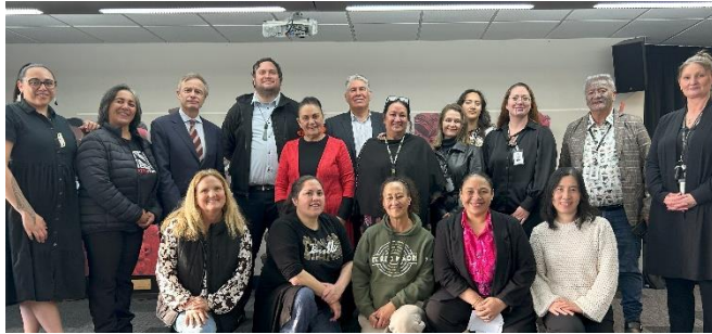
Our team with some of Te Taiwhenua o Heretaunga's managers in Hastings.