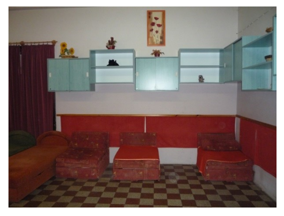
Residential room in the institution

There were apparently few personal items in the residents' rooms. The shelves were empty except for some soft toys. I also pointed out that, in addition to the small living space, the residents' private sphere was also compromised by the lack of personal items. I requested the head of the institution to make the residents' immediate environment more personal, to encourage them, through the caretakers, to put items on the shelves to make their surroundings cozier.