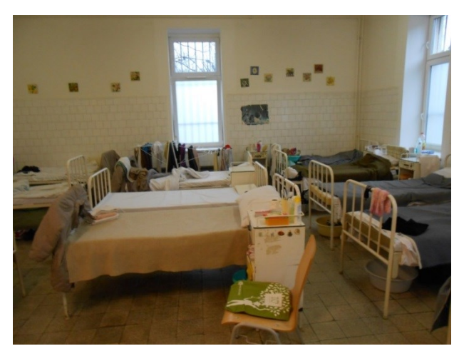
Ward in the FPMI

The FPMI's catering practices were in compliance neither with the relevant legal regulations on catering in inpatient institutions nor with state of health and lifestyle of the regular and sent-in patients. I requested the Head of the Office of the Chief Medical Officer and the Chief Medical Director to address this problem.