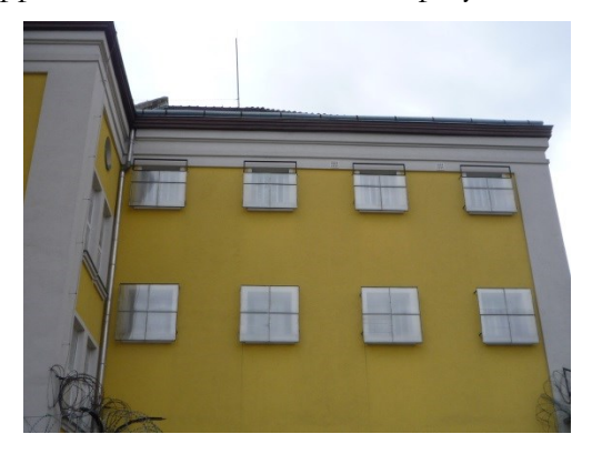
View-blockers on the cell windows of the Sátoraljaújhely Strict and Medium Regime Prison

There were view-blockers installed on the windows facing the street, which, obstructing natural lighting and ventilation, made staying in the cells intolerable in the summer heat. The situation would be a bit improved after replacing the upper third of the blocker with polycarbonates.