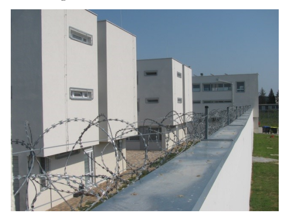
Reformatory, Nagykanizsa Unit

The selection of these locations was motivated by the opening of the Nagykanizsa Unit in late 2015, as a result of which the total capacity of the Hungarian reformatory system had increased by 25 percent. The Nagykanizsa unit is the sole reformatory in Western Hungary. The material conditions of placement in Nagykanizsa were excellent. In Debrecen, the sanitary unit was in need of renovation. The personal items of the detainees could not be seen at either location; the absence of such items was even more apparent in Nagykanizsa due to the bleak decoration. Impersonality was augmented by the prohibition to wear one's own clothing.