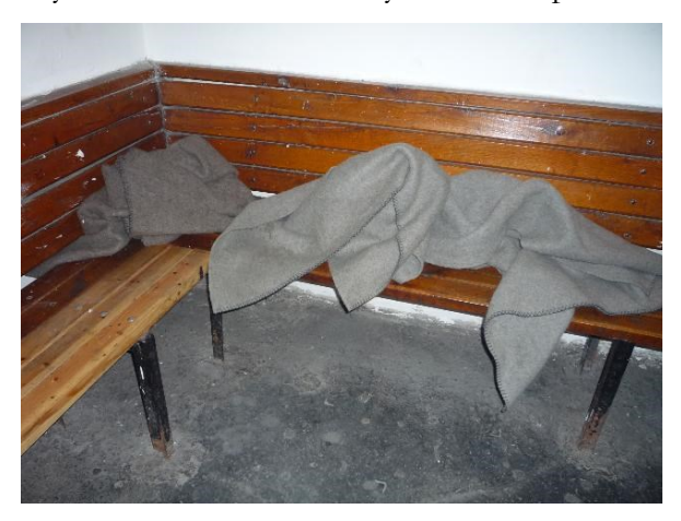
Custody room at the Police Department

to the custody rooms or elsewhere. Should an expecting woman or a woman with a child be arrested, they are placed not in a custody room but in the hallway of the reception area or in the adjacent room.