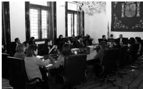
The Ombudsman in a workshop with students from the 11th session of the Master's Program for Applied Political Studies, organized by the International Ibero-American Foundation for Administration and Public Policy.