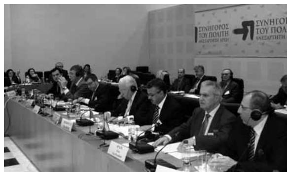
Speech by the Ombudsman, Enrique Múgica, in the third meeting of the Mediterranean Association of Ombudsmen (AOM), in Athens (Greece).

The normal cooperative efforts have continued with organizations that represent the Ombudsman institutions of the various countries with which Spain maintains special relationships and ties. Reference has already been made to the 14th Assembly and Congress of the Ibero-American Federation of Ombudsmen (FIO) held in Madrid. Furthermore, effort continued to be dedicated toward promoting the new Association of Mediterranean Ombudsmen (AOM).