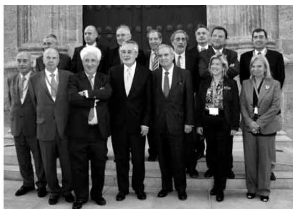
Group photo of the Ombudsmen during the 24th Coordination Workshop.