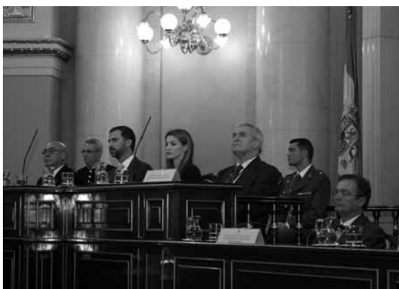
President's table at the Formal Inauguration of the 14th Conference of the Ibero-American Federation of Ombudsmen by TRH the Prince and Princess of Asturias, accompanied by the President of the Senate, Javier Rojo, and the Ombudsman, Enrique Múgica.

course of the 14th Ordinary General Assembly, Peru's Ombudsman, Beatriz Merino, was elected to serve as the new president of the organization, and a collaborative agreement recently signed by the Ombudsman and the Valsaín Foundation was announced. Concurrently, a seminar was held by the Women's Network on the exploitation of women and girls, and the FIO Observatory on Human Rights in Latin America, prepared by the University of Alcalá, was presented. Additionally, the 7th Ordinary General Assembly of the Network of Institutions for the Promotion and Protection of Human Rights (NHRI) in the Americas was held. The Senate. Madrid, 27-30 October: