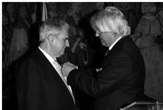
The French Ambassador to Spain, Bruno Delaye, bestows upon Enrique Múgica Herzog the Officer's Badge of the National Order of the Legion of Honour.

launching in Spain of a Spanish-language version of the Yad Vashem website, and the forming the Advisory and Institutional Councils of the Casa Sefarad-Israel . Ministry of Foreign Affairs and Cooperation (Madrid), 27 January.