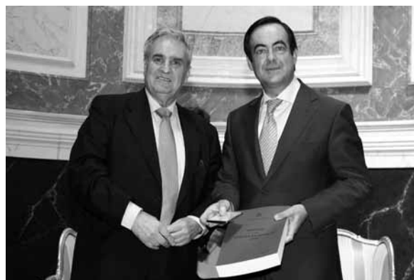
Presentation to the President of Congress, José Bono, the Annual Institutional Report for the year 2009 by the Ombudsman, Enrique Múgica.

There were 269 ex officio enquiries initiated by the Ombudsman, more than in 2008, and, as was the case regarding