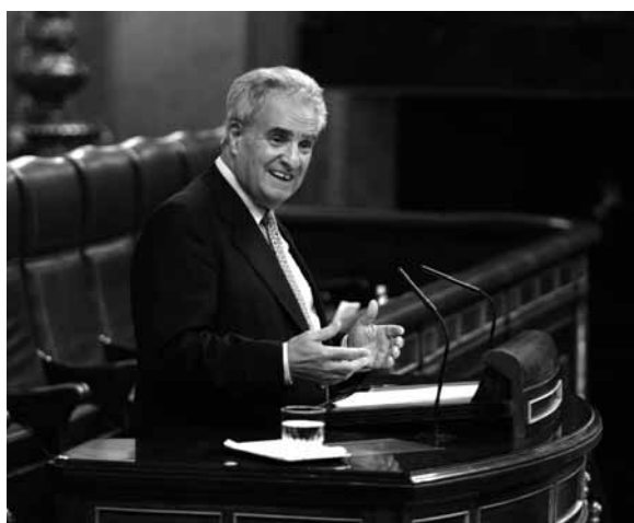
The Ombudsman, Enrique Múgica Herzog during the presentation of the 2008 report at the Plenary Session of Congress.

Finally, the 2008 Annual Report was presented to the Senate and to the Congress of Deputies during plenary sessions held on 24 June and 10 September, respectively.