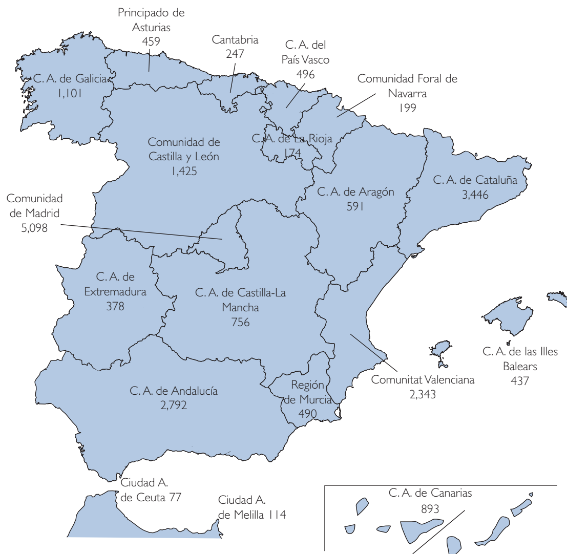
FIGURE 2 Breakdown of complaints by autonomous community, 2009

21,693 (98.52%) complaints were of national origin and 325 (1.48%) originated abroad. In the following tables and charts, a more detailed picture emerges, shown by autonomous community and by province.