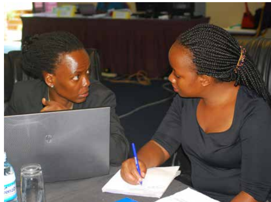
Participants from eleven English speaking National Human Rights Commissions joined the detention monitoring training in Uganda in November

National Human Rights Institutions (NHRIs) have an important role to play in the promotion and protection of human rights, including in the prevention of torture. In 2011, African NHRIs expressed their commitment to taking leadership in torture prevention at a high-level conference in