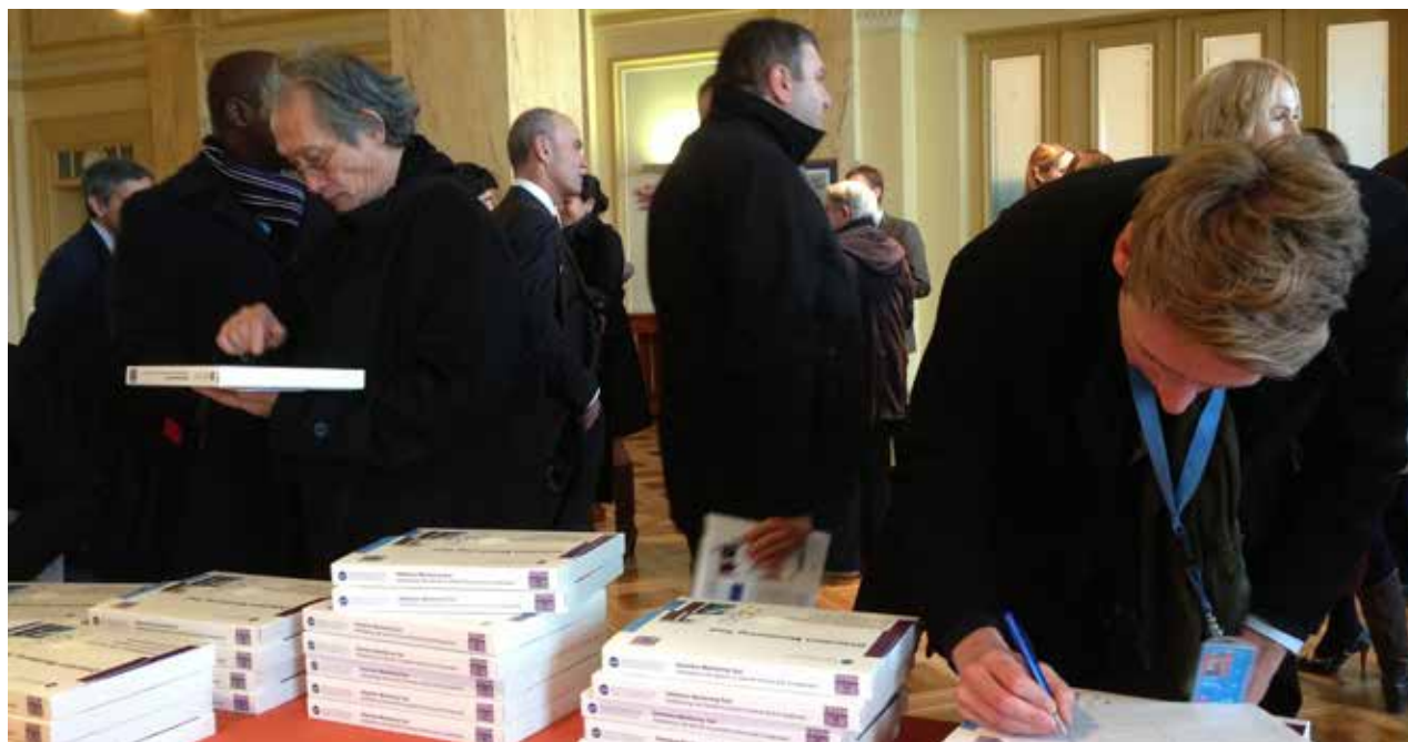
The complete Detention Monitoring Tool - Addressing risk factors to prevent torture and ill-treatment was launched in November and is to date available in English and Russian

During 2013, we translated " Preventing Torture – An Operational Guide for National Human Rights Institutions " as well as " Monitoring Police Custody: A practical guide " into Arabic. The training video, which accompanies and complements the Guide, was subtitled in French and - in cooperation with our partner APF - in Arabic.