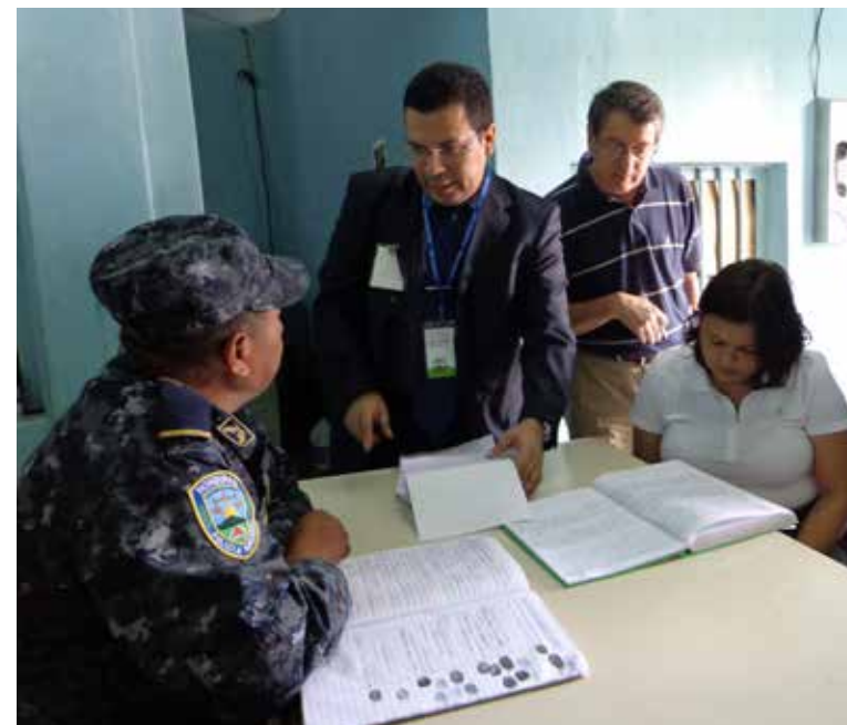
Monitoring visit to a place of detention in Honduras

In 2013, the first specialised NPM in Africa, the National Observatory of Places of Deprivation of Liberty in Senegal , became fully operational and undertook awareness raising activities and visits to places of detention in all regions of the country. The NPM published the report of the SPT's December 2012 advisory visit, and the APT participated in the discussions on possible ways of implementing the recommendations. We further supported the NPM by organising a study visit in Switzerland and through on-going distance advice. In December, a national seminar on the situation in prisons, co-