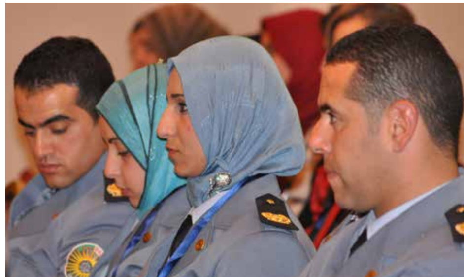
Participants in a torture prevention workshop recommended that Algeria ratifies the OPCAT

We also promoted the implementation of SPT recommendations. In Honduras , for example, we organised a seminar to discuss measures to implement the Prison Act, adopted following an SPT recommendation. In a number of countries, including Argentina , Mauritania and Paraguay , we invited SPT members to participate in OPCAT related activities.