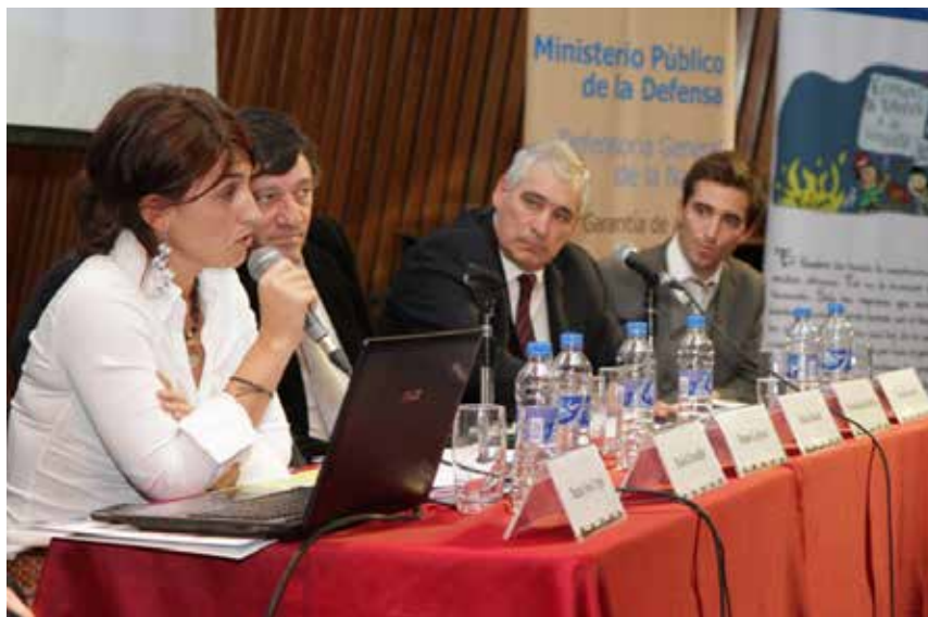
The APT was invited to an event launching a national campaign against torture in Buenos Aires, Argentina, in June .....

Social media is increasingly important, to communicate but also to listen and monitor debates and current issues in our field of work. We have started to explore the use of video to reach out with our messages and to give a voice to our partners. In 2013 we recorded interviews with representatives from the National Preventive Mechanisms of Senegal and Maldives, experts such as the UN Special Rapporteur on Torture as well as