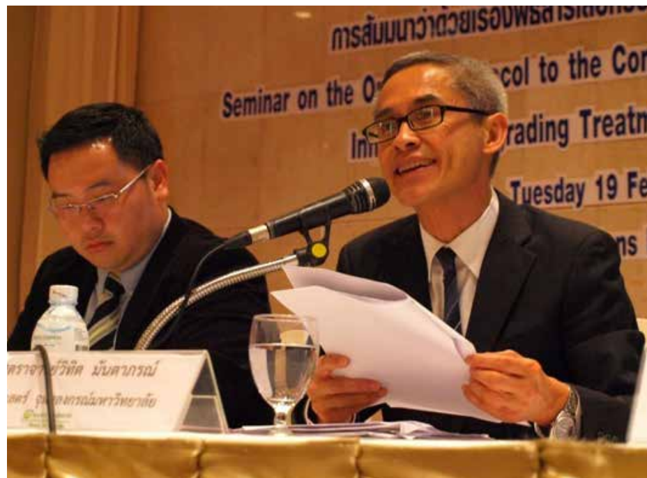
Speakers during a seminar on OPCAT in Thailand in February

One of the obligations of State parties to the Convention against Torture is to make torture a specific criminal offence under their domestic law. The APT advocated for the adoption of effective anti-torture legislation during State review at the Human Rights Council and with treaty bodies.