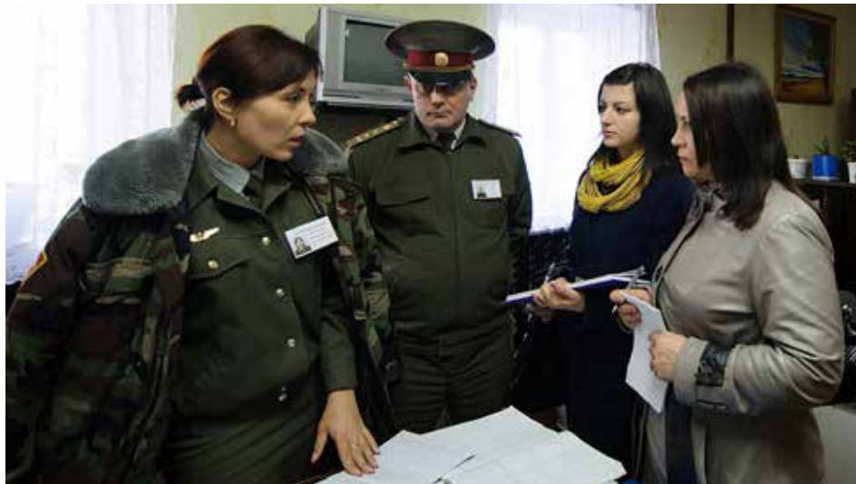
Independent monitoring of the police is crucial to prevent abuse. Torture and other ill-treatment often happen during the early stages of detention – when a person is arrested, transported and interrogated by the police.