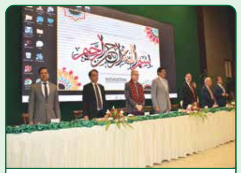
Standing in respect of the national anthem