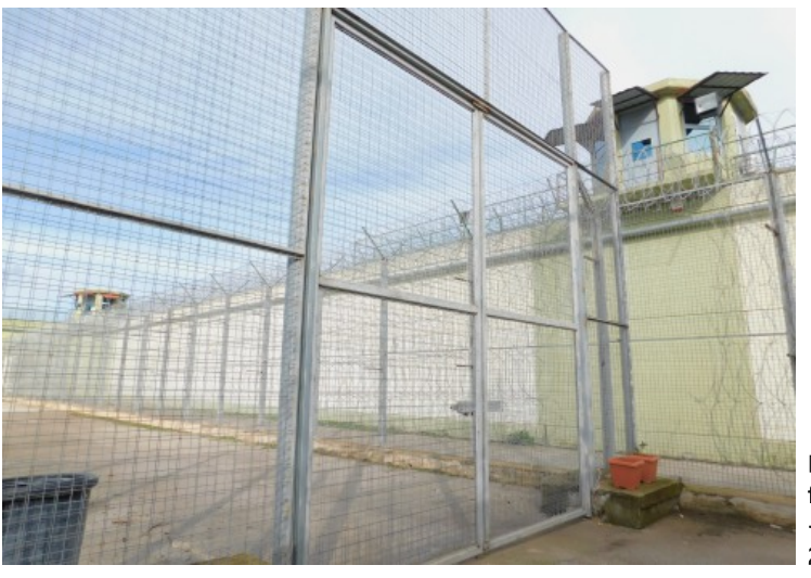
Malandrino detention facility, Fokida - inspection on 25-26/11/19

Lack of flexibility from the prison administration regarding the handling of medical emergencies amplifies problems associated with the remote location of certain detention facilities. For example, in the case of Malandrino detention facility, when the required medical assistance is not available in the Health Center of Lidoriki or the Hospitals of Amphissa or Lamia, detainees are not transferred to the nearest