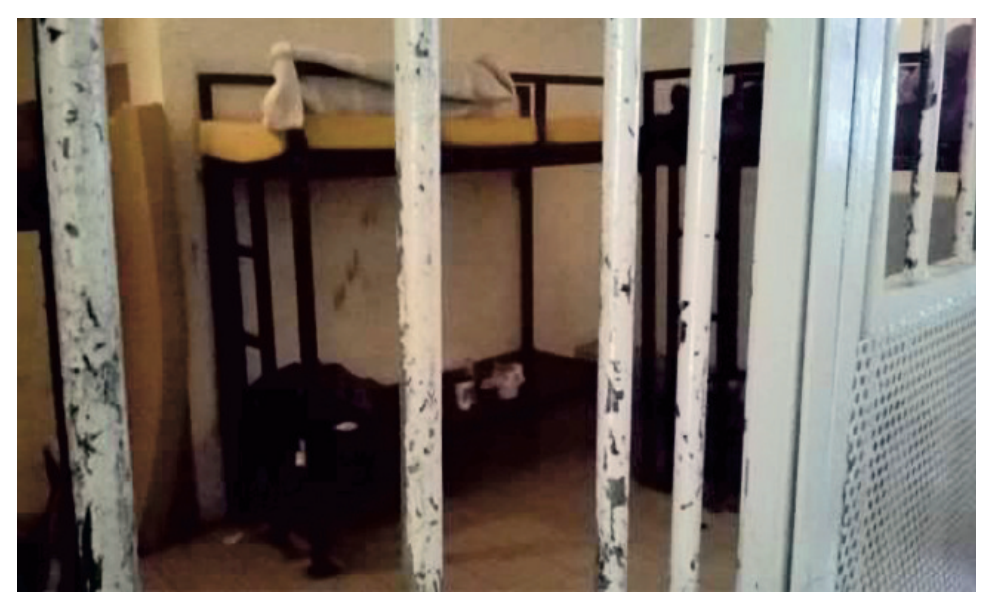
Larissa Security Department cells - inspection on 1/10/19

On the day of the inspection, 31 third-country administrative detainees were held, including three minors under protective custody whereas the only criminal detainee had been just released. Administrative detainees remained in custody from three days up to two months.