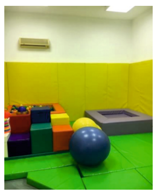
Care Institution Center for Individuals with Heavy Mental Disabilities "White Butterflies" (Volos) inspection on 1/10/19

The center has 157 beds (153 were full on the day of the visit) and accommodated disabled persons, patients with chronic conditions and Hansen's disease. There were five wings in total and the staff amounted to 120 persons (nurses and auxiliary personnel). The patients' needs were not met due to the small number of scientific and auxiliary personnel per accommodated person. In order to meet the needs of the beneficiaries, the administration had requested a greater number of male nurses and additional auxiliary personnel. There were two psychologists and three social workers available in the unit. All doctors were visiting doctors with a fixed-term contract. During the time of the inspection, 10 to 12 scientists (psychologists, social workers, sociologists, nurses, ergotherapists, physiotherapists) were recruited via the annual Manpower Employment Organization program for young scientists. The main aim was a more community-oriented approach, rehabilitation and the