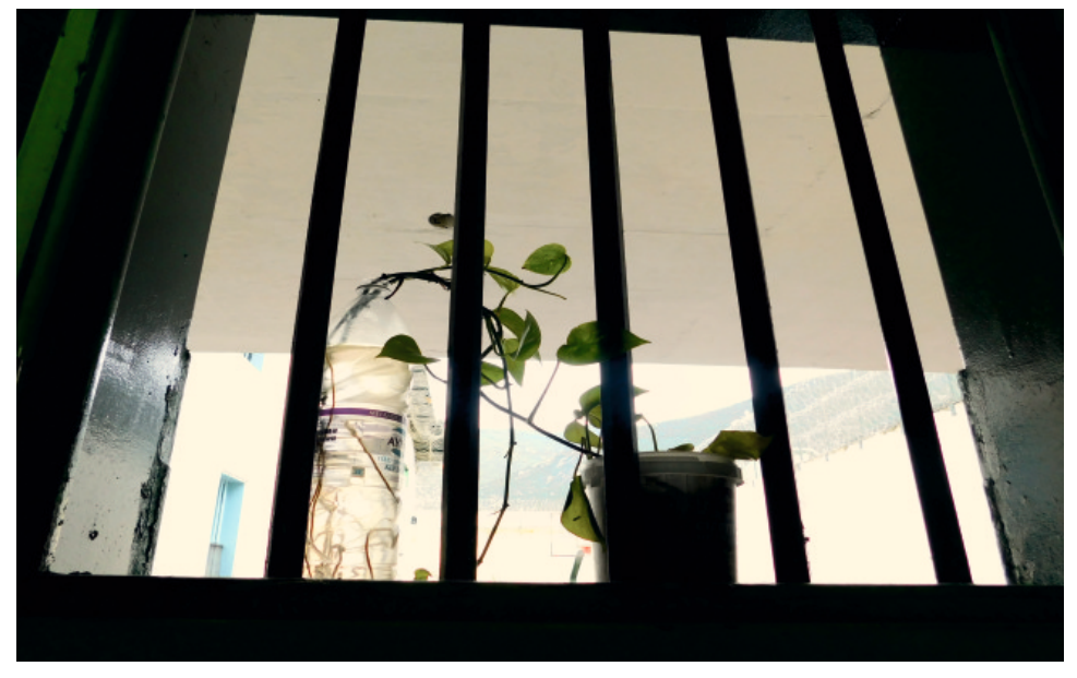
Malandrino detention facility, Fokida - inspection on 25-26/11/19

Furthermore, this year was marked by key institutional developments regarding the function of detention facilities, namely the transfer of crime policy to the Ministry of Citizen Protection, the transfer of migration competences from the Ministry of Migration and Asylum<sup>2</sup> to the Ministry of Citizen Protection, changes in the conditions regarding the prerequisites for the administrative detention of third-country nationals (L.4636/2019 entry into force on 1.1.2020) and finally, the amendments introduced with the double criminal reform of the new penal code and subsequently the code of penal procedure<sup>3</sup>. In that context, the Mechanism monitors all recent developments in order to ensure their compatibility with guidelines and priorities set by the international and European legislation. The Mechanism shall continue to monitor all recent developments and assess their actual impact on detention conditions in the light of the detainees' human rights.