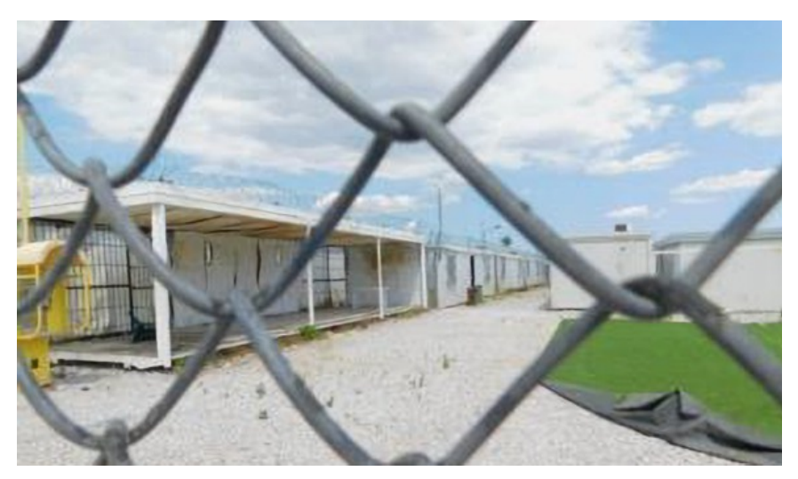
Amygdaleza Pre-removal Detention Center (Attica) - inspection on 18/7/19

During our inspection, 75 unaccompanied male minors were held in the center. That number changed constantly due to the entrance of new minors and the placement of others in accommodation facilities via the National Center for Social Solidarity (NCSS). In average, the center received 40 to 50 children per month. In most cases, the children were between 16 and 18. In case of doubt, they were accompanied to