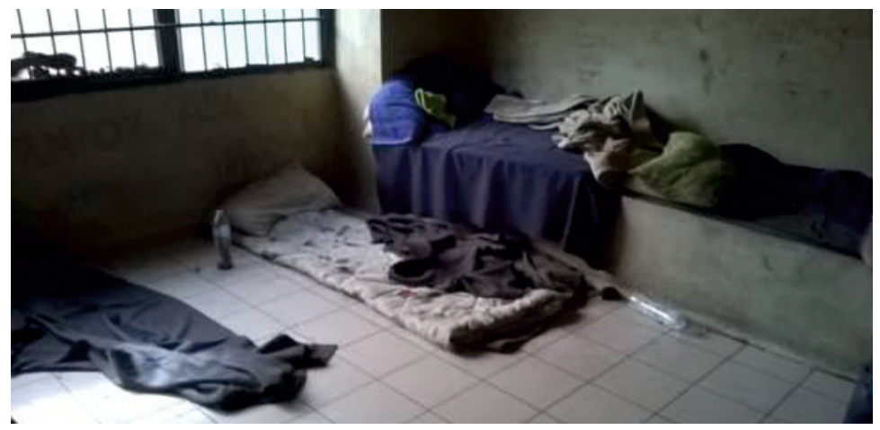
Omonoia police station cells - inspection on 15/2/19

The cells of the security department with a capacity of seven persons were recently reconstructed. At night, however, the number of detainees could amount to 25. On the day of the inspection, four persons were held all of whom on criminal grounds; according to their allegations they were held for two to three days. The walls were filthy and the floor gave the impression that it had not been cleaned for days. There was enough natural light but the windows had no shutters. The cells had three stone