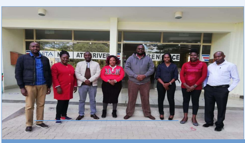
Members of the Staff Wellness Committee during a workshop at NITA, Athi River

The exercise was conducted with the guidance of the officers from the Ministry of Health.