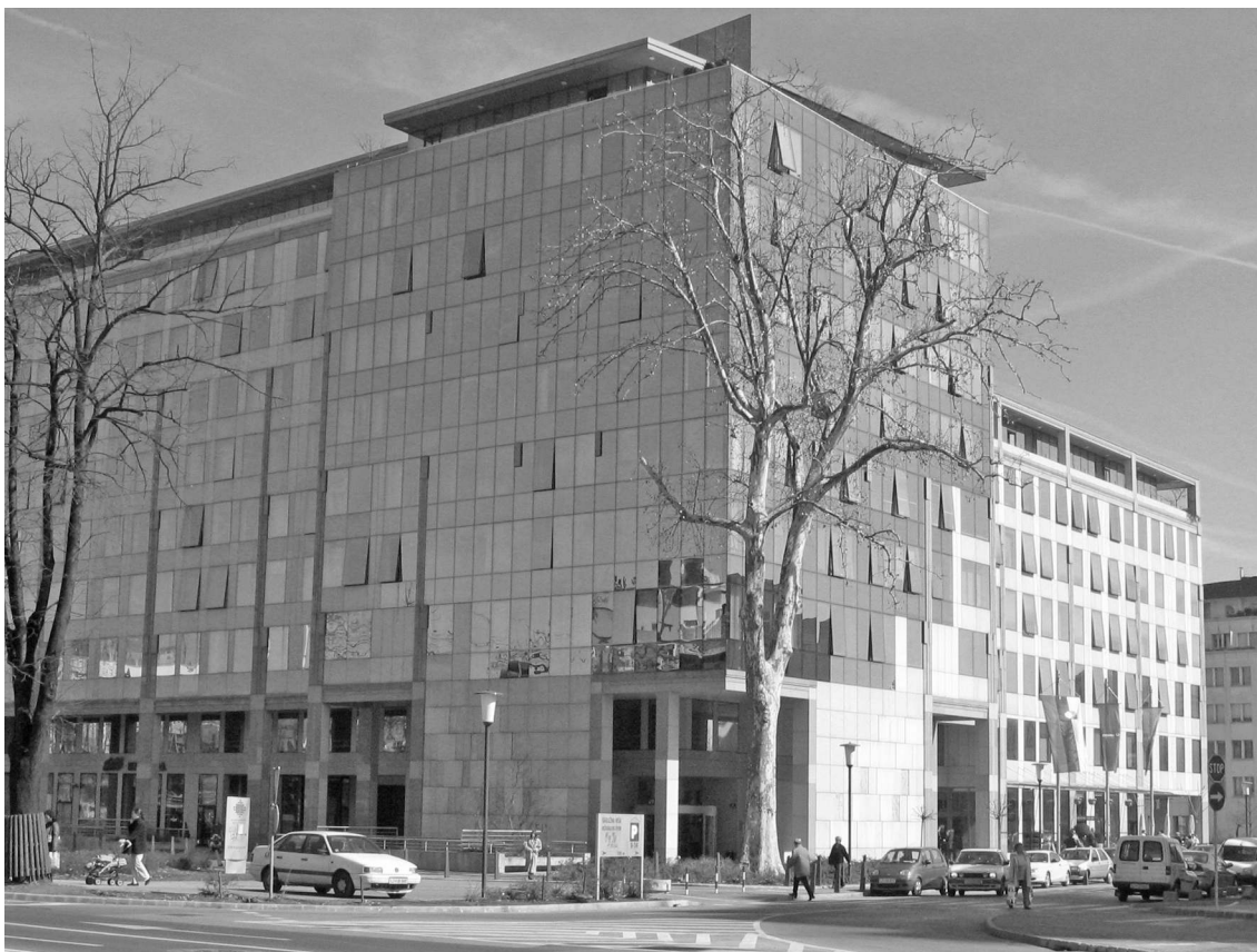
The building in which the office of the Human Rights Ombudsman is located