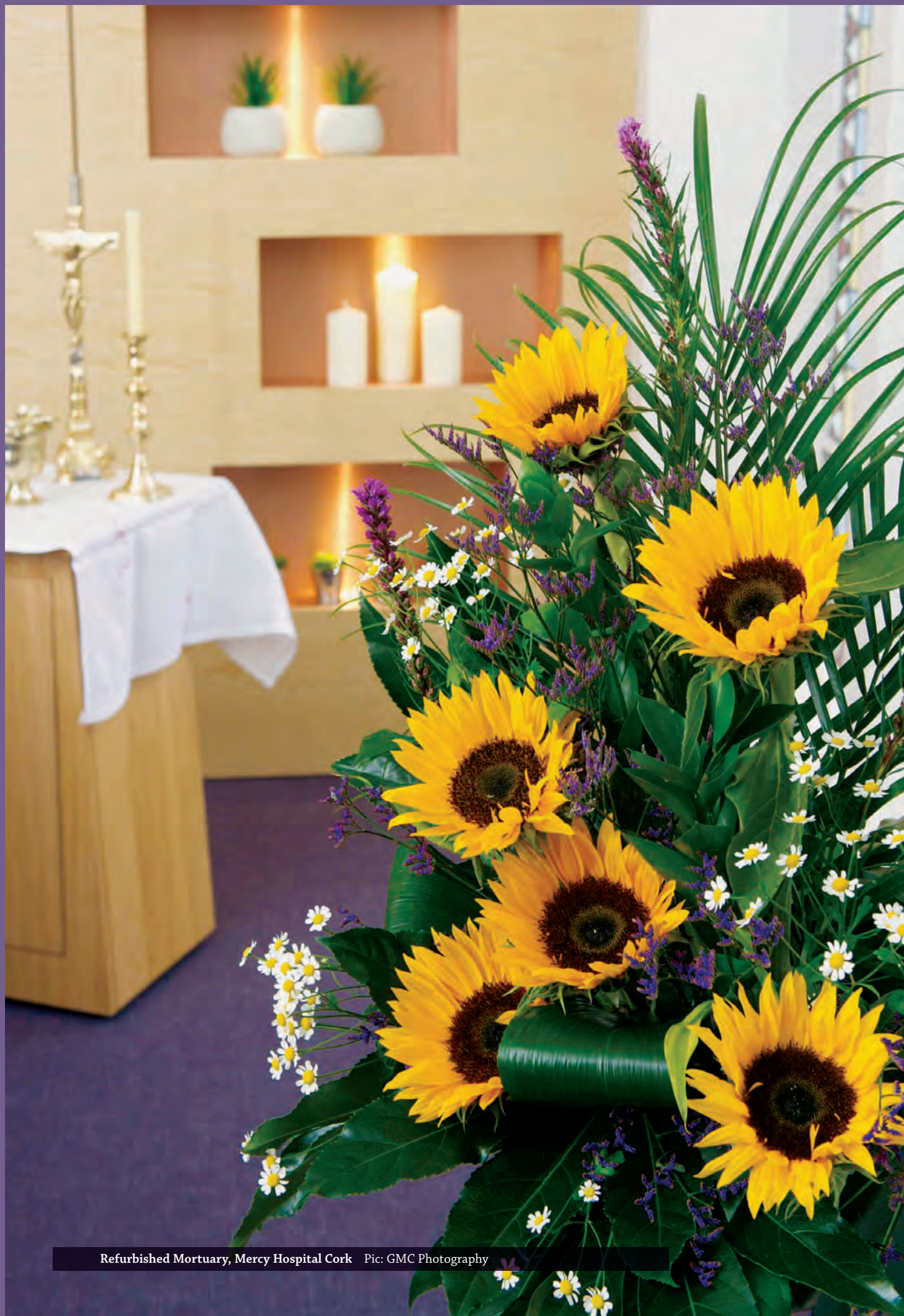
Refurbished Mortuary, Mercy Hospital Cork