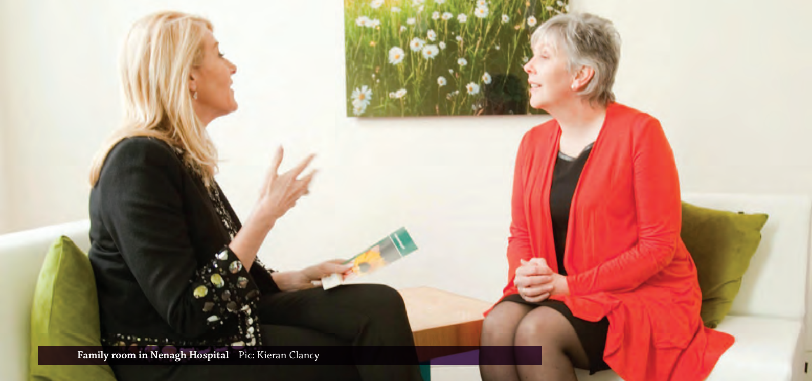
Family room in Nenagh Hospital