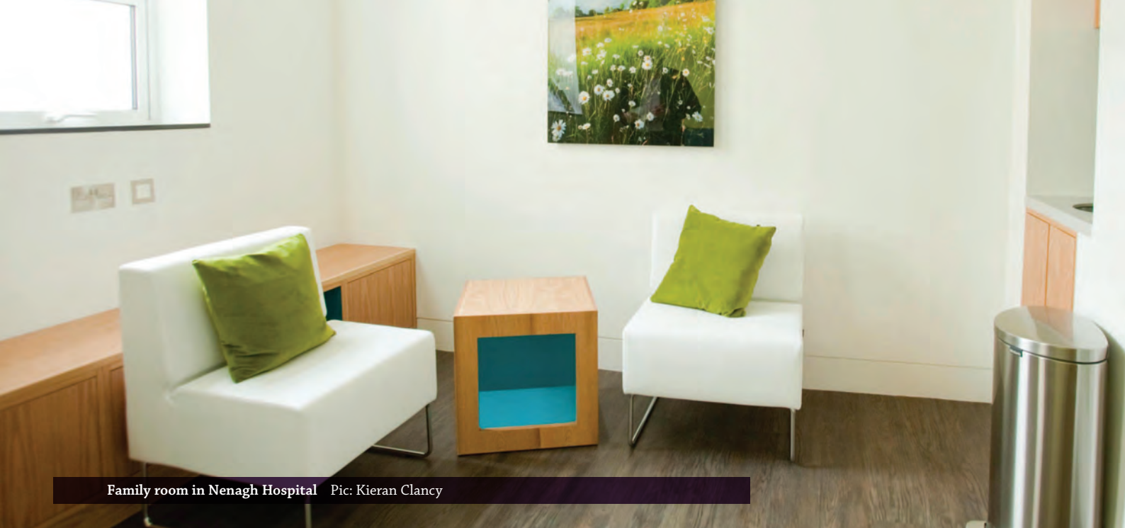
Family room in Nenagh Hospital