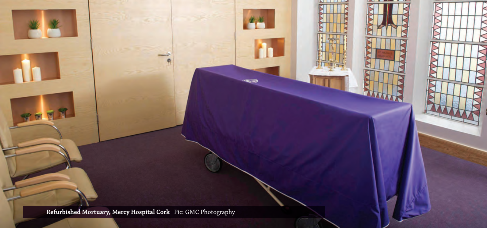
Refurbished Mortuary, Mercy Hospital Cork