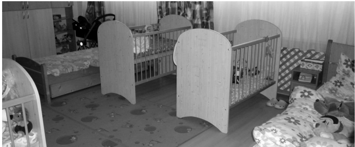
Reménysugár Children's Home

difficult by either serious disability or the need of the joint placement of siblings. The ten staff members of the children's home take care of the children under three in turns, which makes the formation of personal attachment impossible. The majority of children attended kindergarten or school outside the institution; their systematic development and engagement were ensured in the children's home as well.