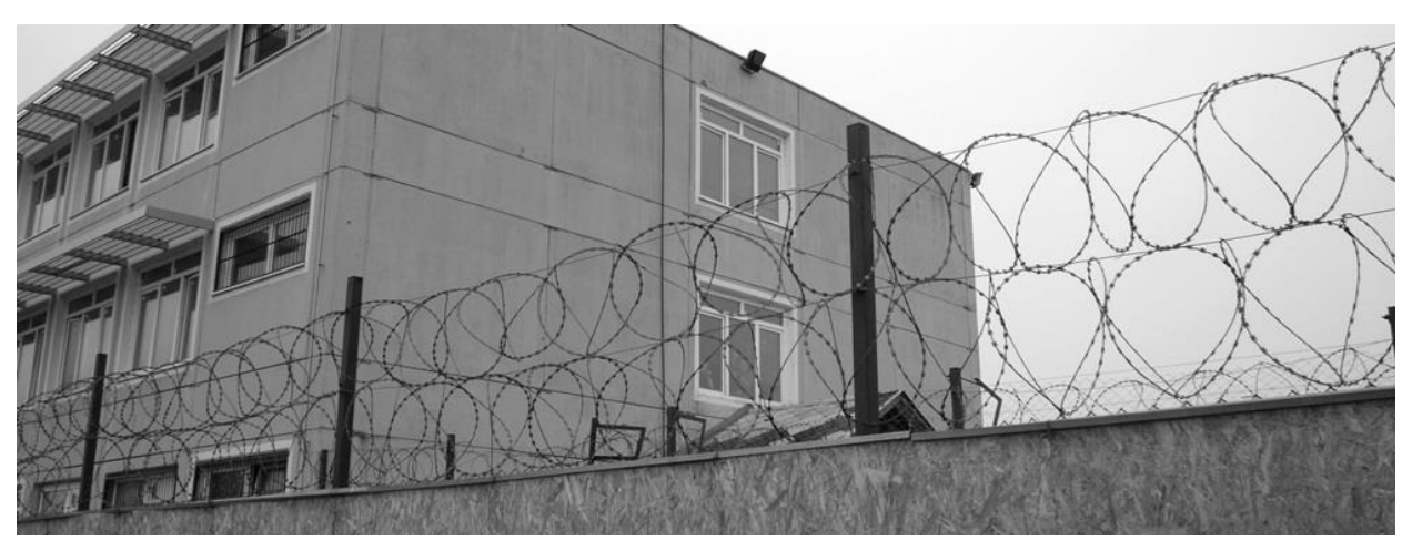
At the time of the visit, there were some children detained in the GRRC.

Despite the fact that even the longest period spent in the GRRC by one of its current residents was less than two weeks, this period had also left some psychological marks. Many of the detainees complained that, in the absence of organized programs, as a result of day-long inactivity, detention was rather wearing not only physically, but also mentally.