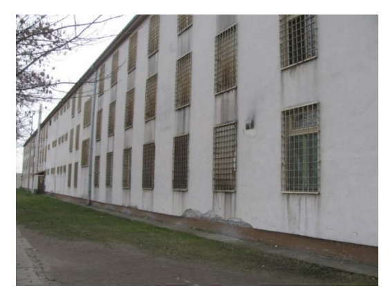
Juvenile Penitentiary Institution (Tököl)

The OPCAT is open to accession by any State that has ratified or acceded to the UN Convention against Torture and other Cruel, Inhuman or Degrading Treatment or Punishment.<sup>2</sup> Hungary acceded to the Protocol on January 12, 2012, more than two decades after ratifying the UN Convention. The Parliament designated the Commissioner for Fundamental Rights<sup>3</sup> as the national institution conducting regular, unannounced visits to places of detention (hereinafter the "National Preventive Mechanism, NPM"<sup>4</sup>). I have to carry out this task as of January 1, 2015. <sup>5</sup>