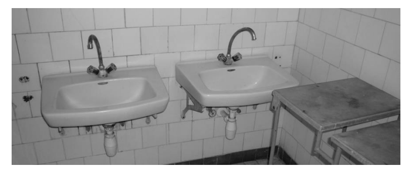
Lavatory in the Therapeutic House

In the Platán Residential Home, disabled persons deprived of their liberty had no access to intimacy room, and in the Therapeutic House there were cases when residents wanting to use the intimacy room had to stand in a queue. They had to ask for the key from a member of the staff, and they could use the intimacy room only after a certain, predetermined period of dating, with the approval of the staff.