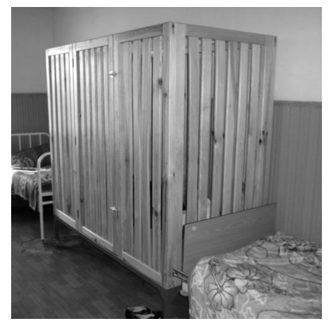
Adult cage bed

I also drew attention to the shortcomings of the protocol on restrictive measures vis-à-vis disabled persons living with disabilities in my reports on both the Therapeutic House and the Platán Residential Home. In the case of the Therapeutic House, I also suggested the termination of the use of cage beds for adults. In connection with the Platán Residential Home, I pointed out that organizing various leisure and community activities for disabled persons deprived of their liberty could render unnecessary or, at least, significantly reduce the use of tranquilizing shots.