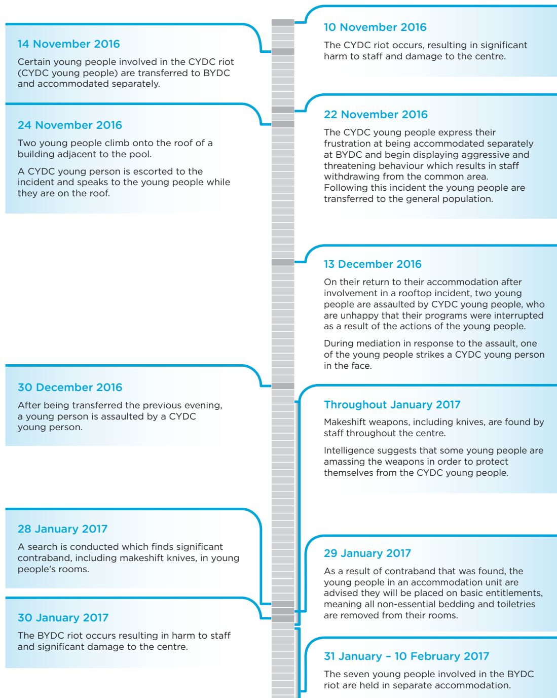
Figure 1: Chronology of events