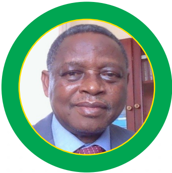
SPEAKER 1 HON. JUSTICE (RTD.) MATTHEW PAUWA MHINA MWAIMU, OMBUDSMAN OF TANZANIA,

Will discuss "Understanding the Role of Ombudsman Institutions in Promoting Human Rights."