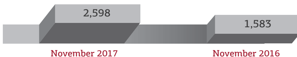
Chart 2 Detainees in Pre-removal Centres

The respective number of immigrants being held for return in police cells on 1.11.2017 was 974 people, a fact that confirms the detention in interim places until a space can be found in the Pre-removal Centres, but also the great number of administratively detained people by the Greek police in total. The Ombudsman acknowledges the provision of data for detainees outside of Pre-removal centres in 2017, as an obvious example of transparency by the Greek Police. Nevertheless, he cannot but again re-emphasize that the 27% of the total number